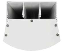
Cableway Option Available