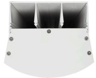
Cableway Option Available